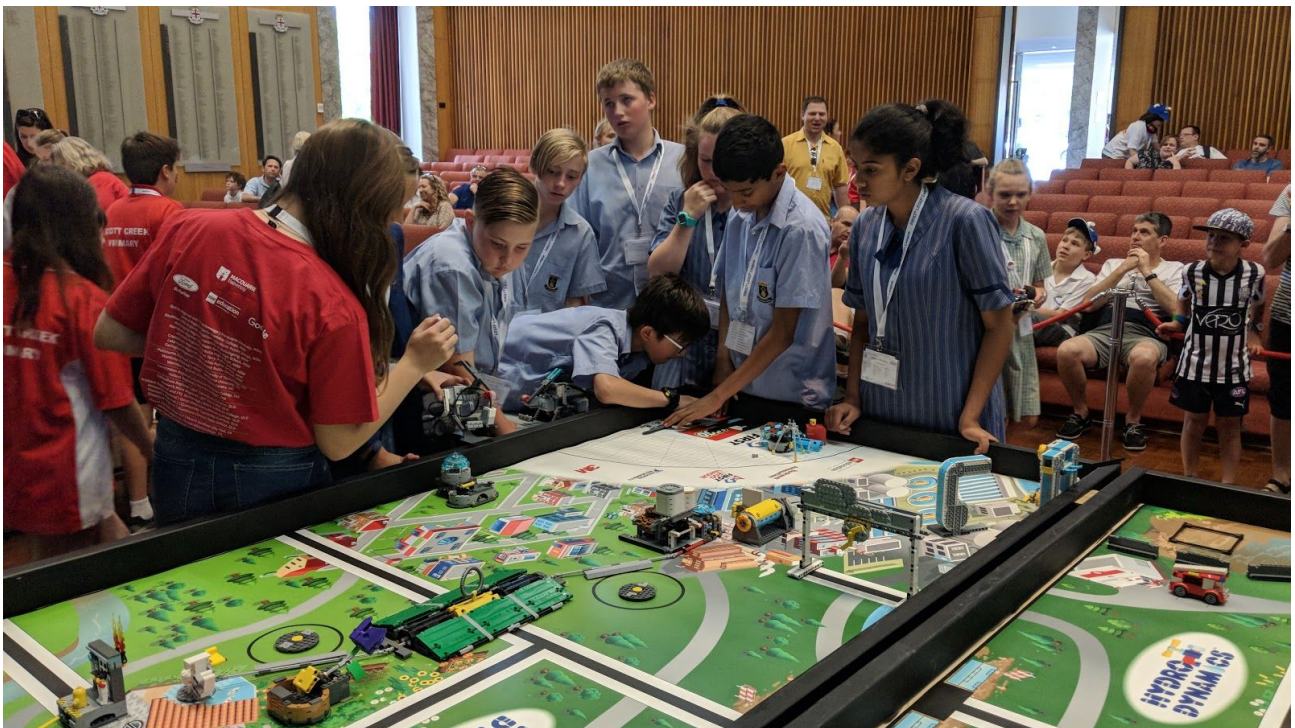
Students have been building and programming autonomous EV3 LEGO Robots

What is LEGO League? It's a world wide competition that brings together young children in the pursuit of encouraging them to continue with careers in STEM (Science, Technology, Engineering and Mathematics).