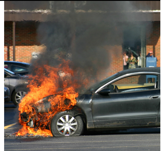
EQUIPMENT & VEHICLE MAINTENANCE

Visit the South Australia Police website: police.sa.gov.au for more bushfire prevention fact sheets and information.